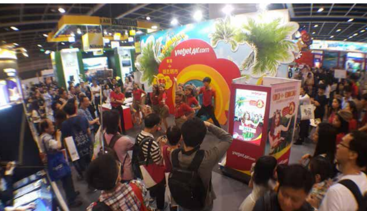
Vietjet attracted visitors at International Travel Expo in Hong Kong (ITE) 2017

In June, 2017, Vietjet joined in the Hanatour International Travel Show 2017 from June 9 to June 11, 2017 in Korea International Exhibition & Convention Center (KINTEX); International Travel Expo in Hong Kong (ITE) 2017 from June 15th to June 18th, 2017 at Hong Kong convention and exhibition centre and other activities in Myanmar plaza. These brought visitors young flashmob, interesting entertainment activities with valued gifts and opportunities to buy economic flight tickets.